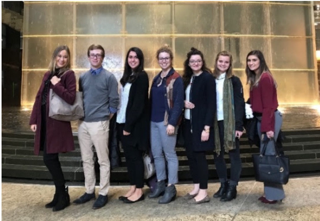
Group photo of some of our members in Detroit at the Quicken Loans agency tour this past Friday.